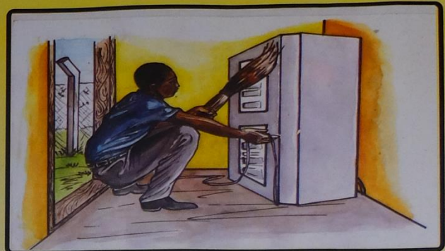
REGULAR CLEANING OF INVERTER CLEAN DUST USING A DRY CLOTH AND BROOM